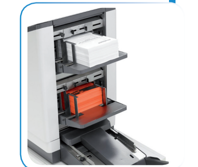
Tower Feeder w/ High-Capacity Trays and optional Accumulation/Divert Deck

Formax - New Hampshire, USA www.formax.com