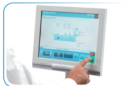
15" Color Touchscreen Interface

* Paper & envelope specifications may vary. All media must be tested.