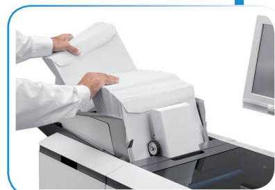
High-Capacity Envelope Feeder