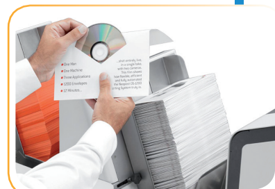
Feeds a variety of media