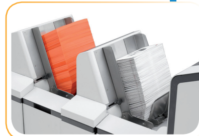
High-Capacity Versatile Feeders